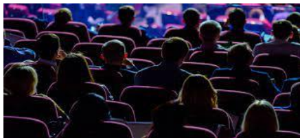
3. audience (n)

a. having the ability to do something well