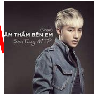
5. single (n)