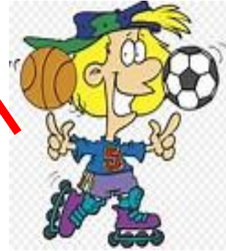
4. talented (adj)

e. the people who watch, read or listen to the same thing