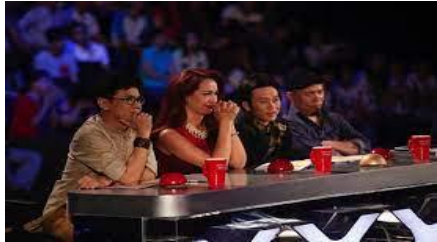
2. judge (n)